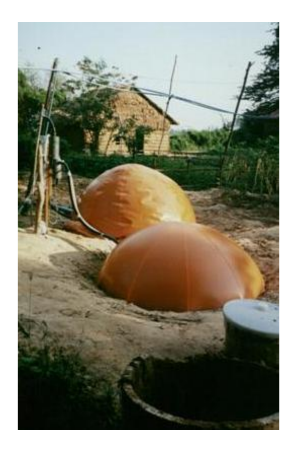
Figure 3: The "super-gas" mixing biodigester installed in UTA, Cambodia

As the substrate ferments, pressure is built up in the reactor (in the foreground of Figure 3) and forces part of the substrate into the reservoir (background of Figure 3). When the pressure reaches 60 cm of water column the valve (left background in Figure 3) opens, thus equalizing the pressures in reactor and reservoir so that the substrate returns rapidly to the reactor producing a mixing reaction in the process. A pilot model of this system was installed in UTA, Cambodia in June 2001. Initial results were excellent with high and efficient gas production. However, the gas pressure reached at the peak moment eventually proved to be too much and the junction of the pipe at the base of the balloons was forced out of the reservoir balloon and the system collapsed. As with the "HAFSC" model, the idea behind the "super-gas" mixing system is a good one and should be further developed using alternative materials as welding of PVC sheets is a demanding technology required skilled craftsmen and sophisticated equipment.