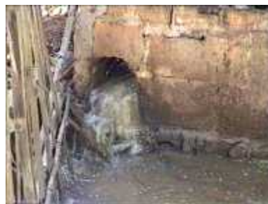
Photo 2. The waste water running out of the pen