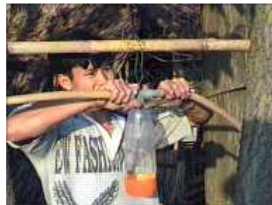
Photo 50. Joining the other end of the PVC "T" to the plastic hose that goes to the reservoir bag