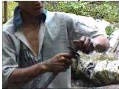
Photo 86. Taking out the gas outlet to be reused