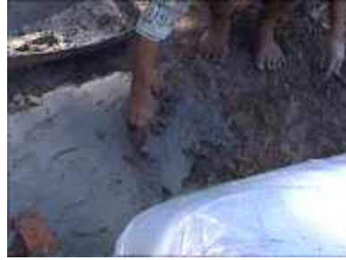
Photo 90. A mixture of soil and cement to cover the upper part of the walls of the trench