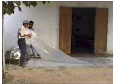
Photo 7. Cutting the second piece of plastic

Photo 6. Putting a steel rod (or bamboo pole) through the centre of the roll facilitates the extraction of the required length of tube