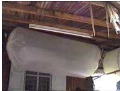
Photo 62. A string around the bag is used to increase the pressure