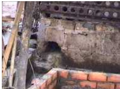
Photo 64. A channel is made with bricks to lead the waste from the pig pen to the

Channels are made with bricks and cement to link the waste outlets from the pig pens with the inlet of the biodigester.