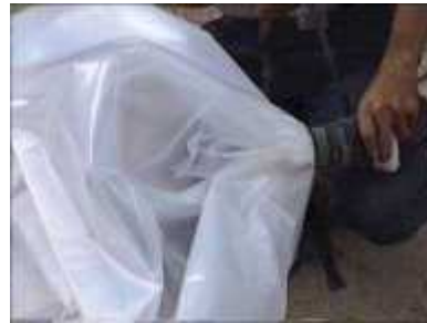
Photo 52. Fastening the closed end of the plastic tube with a rubber band