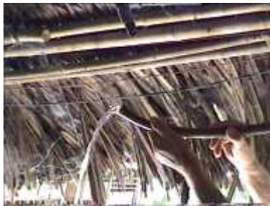
Photo 78. Accumulation of water. Open the joins and take out the water as it can be accumulated (# 6-1)