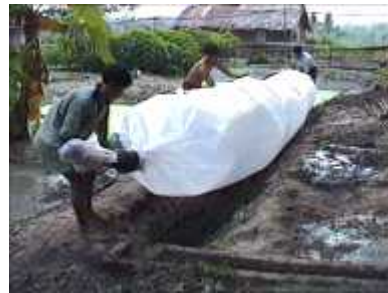
Photo 40. Placing the digester in the trench