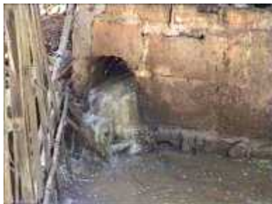
Photo 72. Before placing the biodigester