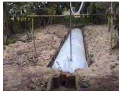
Photo 67. The finished installation