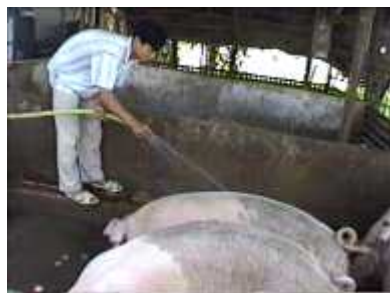
Photo 1. Washing the pig pen

The process of fermentation in biodigesters results in transformation of organically bound carbon into gaseous carbon dioxide and methane. The anaerobic environment and extended retention time also inhibit the growth of most pathogenic organisms and prevent the survival of intestinal parasites. It is therefore to be expected that both the chemical and biological parameters of livestock excreta will be improved by passage through biodigesters