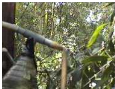
Photo 76. Hose pipe bent down (#4) Cut the damaged hose and join it again