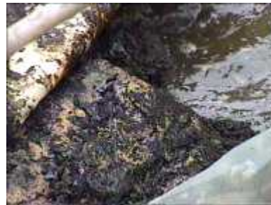
Photo 83. Hard layer of manure due to accumulation of soil in the trench and time (3 years). The plastic was in good condition