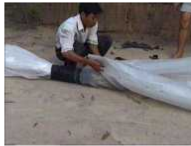
Photo 32. Attaching a plastic tube of 3 m length