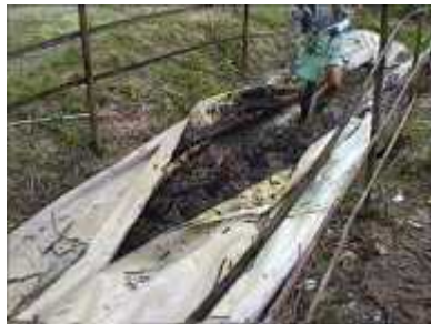
Photo 82. Cutting the plastic to take out the contents