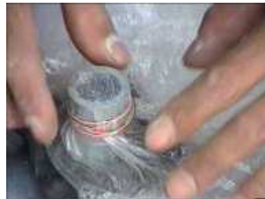
Photo 25. Covering the entrance of the inlet pipe with a plastic bag