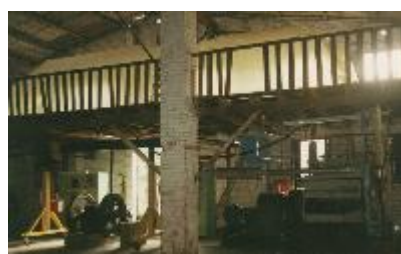
Photo 98. A large reservoir bag provides biogas for a diesel generator in the integrated farm of Pozo Verde, Colombia