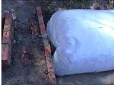
Photo 89. A small wall of brick to avoid the soil entering and rain water entering the biodigester.