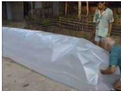
Photo 29. Pumping air until the tube is full