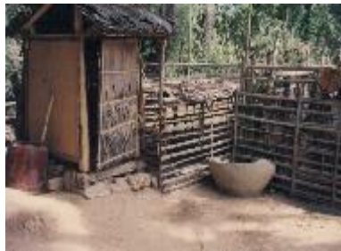
Photo 75. In Cambodia the latrine is always linked to the plastic biodigester