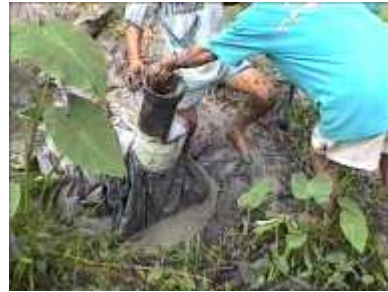
Photo 87. taking out the rubber bands and inlet and outlet pipes to be reused