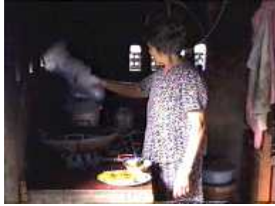
Photo 60. Connecting the reservoir bag to the stove in the kitchen