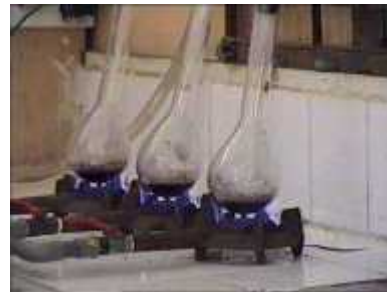
Photo 96. Using the biogas to digest samples for Nitrogen analysis