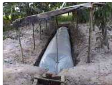
Photo 69. Roofing can protect the biodigester