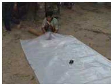
Photo 18. Placing the pipe

The ceramic pipe is inserted to one half of its length in the interior of the plastic tube and the plastic tube is folded around it. The join is secured by wrapping the rubber bands around the pipe beginning 25 cm from the edge of the plastic and working towards the exposed part of the ceramic pipe, each band overlapping the previous one, and finishing on the ceramic pipe so that the edges of the plastic tube are completely covered.