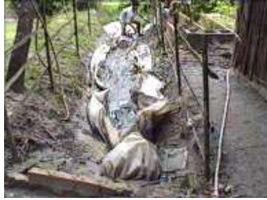
Photo 84. After removing all the content of the digester