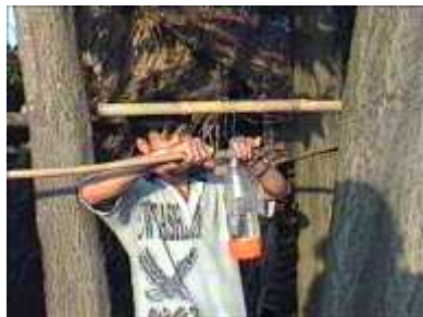
Photo 49. Suspending the water trap