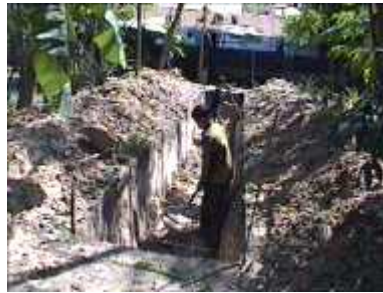
Photo 5. Excavating the soil