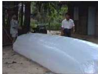
Photo 38. The biodigester is full of air