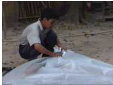
Photo 51. Closing one end of the 3m plastic tube

The arms of the "T" are connected to the gas line; the inlet to the biodigester and the outlet to the stove in the kitchen.