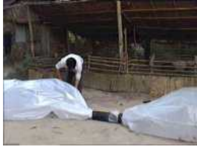
Photo 35. Untying the plastic bag