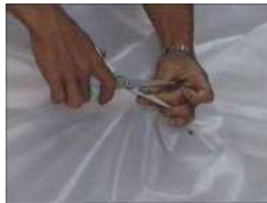
Photo 15. Cutting the plastic