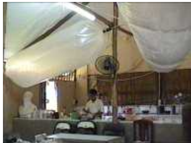
Photo 95. Reservoir bags storing biogas in the the laboratory of UTA