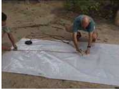
Photo 12. Measuring the distance

The installation of the gas outlet is now complete.