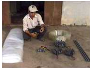
Photo 11. Materials for installing a plastic biodigester