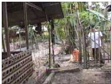
Photo 68. Fencing around the area where the biodigester is located