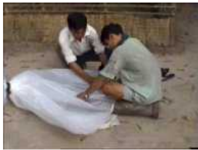
Photo 31. Placing the outlet pipe (following the same procedure as for the inlet pipe)

The bag is filled with water until the inlet and outlet pipes are sealed (covered with water) from the inside. The air inside the bag is now trapped in the upper part. Filling with water is suspended and the plastic bags over the exit and entry pipes can be removed.