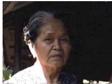
Photo 63. It is the women who benefit most from the installation of a biogas