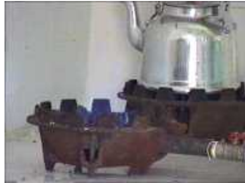
Photo 94. In the small-holder farm the gas is enough to cook for the whole family and when there is a large population of livestock it will be enough to cook for the pigs also (Vietnamese tradition)