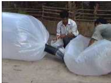
Photo 37. Forcing the air into the main tube until it is full