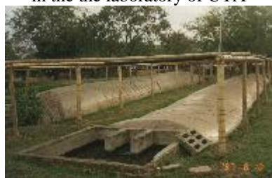
Photo 97. The use of plastic biodigesters to recycle the manure from in Pozo Verde farm, Jamundi, Colombia