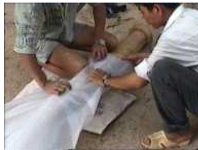
Photo 21. Ready to tie