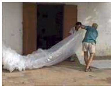
Photo 10. Putting one plastic inside the other to give added strength

Photo 9. Starting to put one plastic tube inside the other to give added strength