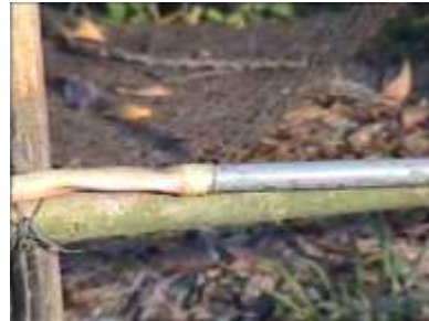
Photo 48. Connecting a plastic hose to the PVC pipe of the gas outlet