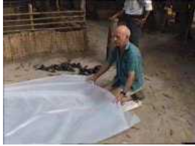
Photo 27. Holding the plastic