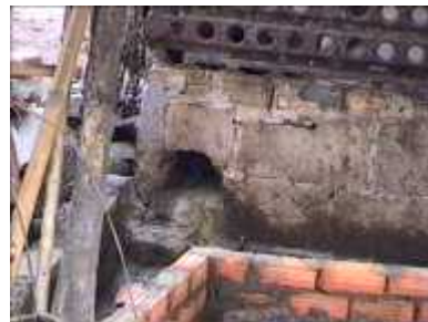
Photo 73. After placing the biodigester