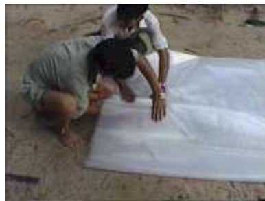
Photo 19. Starting to fold up the plastic in the middle