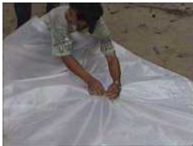
Photo 14. Holding the plastic