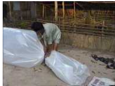
Photo 30. Tying the tube but leaving enough plastic to insert the outlet pipe