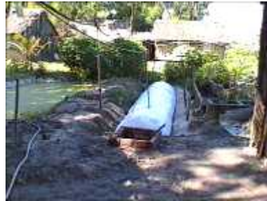
Photo 92. Make a system so the rain water is led away.