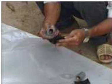
Photo 16. Preparing the materials for the gas outlet