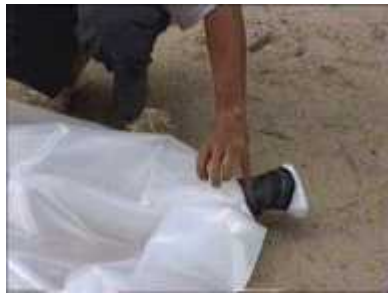
Photo 53. One end of the tube is closed