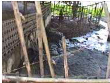
Photo 70. Before placing the biodigester

The farm family no longer need to buy liquid gas for cooking. The savings will help the cost of the biodigester in less than 12 months