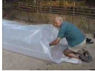
Photo 28. Pumping air