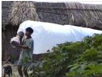
Photo 39. Carrying the biodigester