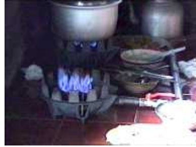
Photo 61. Cooking with biogas