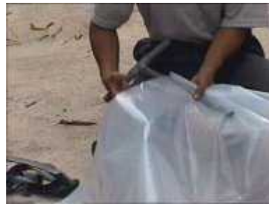
Photo 54. Placing the PVC "T" at the other end of the 3m plastic tube (one of the end of the "T" is joined to the hose coming from the digester and the other to the stove)