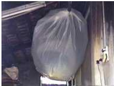
Photo 59. The reservoir bag full of biogas