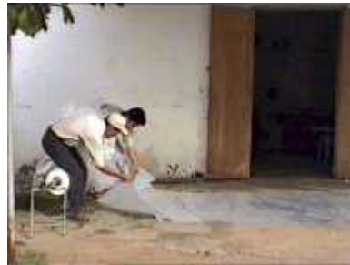
Photo 8. Bundling one plastic tube in preparation for putting it inside the other

Photo 7. Cutting the second piece of plastic