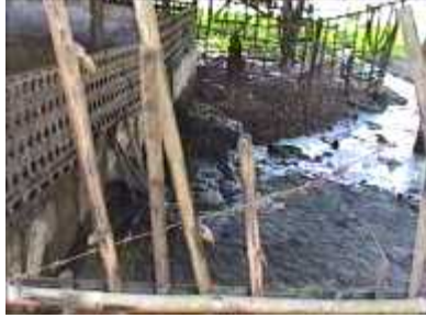
Photo 3. Pollution