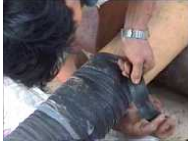
Photo 24. Completing the wrapping of the plastic over the inlet pipe