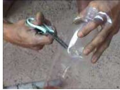
Photo 46. Cutting a hole to add the water