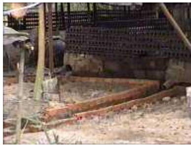
Photo 66. Channel completed

With the channels in place the washing of the pens automatically forces the slurry into the biodigester