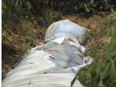
Photo 81. The outer plastic layer damaged (after 3 years..!). The inner one is still gas-tight.