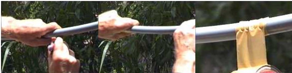
Photo 79. Make a hole in the PVC pipe, take the water out and stick it again with tape or a rubber band (# 6-2)