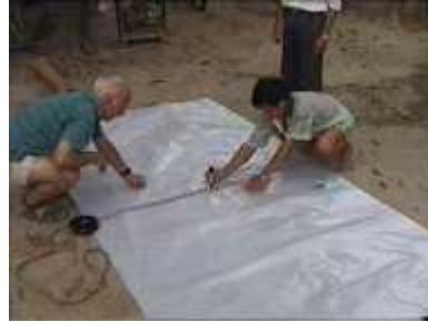
Photo 13. Marking the place to cut the plastic