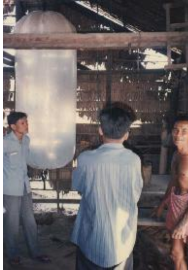
Photo 93. Reservoir bag placed vertically in the kitchen in Cambodia