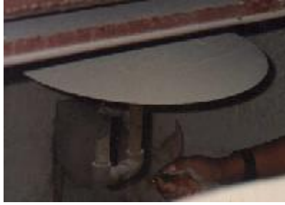
Photo 99. The use of biogas to heat the piglets in Pozo Verde farm, Jamundi, Colombia