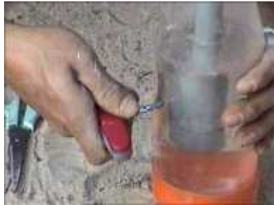
Photo 47. The PVC pipe is inserted into the bottle and a little hole is made to fix the water level