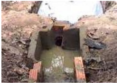
Photo 91. Make a system to capture the sand in the inlet box