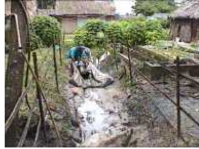
Photo 85. Pulling the plastic to one side of the trench