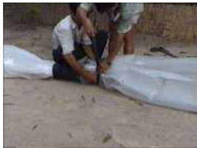
Photo 33. Tying the 3 m length of plastic tube to the exit pipe