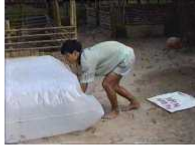
Photo 36. Forcing the air from the 3m tube to the main tube