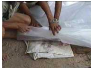
Photo 20. Finishing one side