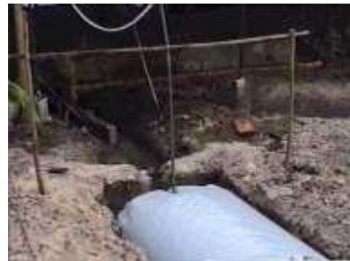
Photo 65. The channel is connected to the biodigester