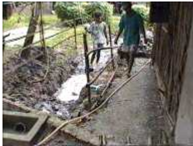
Photo 88. Starting to fix the trench