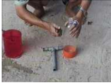
Photo 45. Materials to prepare the trap (PVC "T" and PVC pipe, old plastic bottle, knife and water)