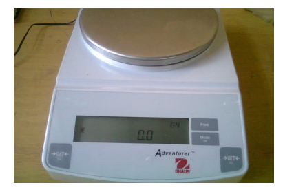
Figure 1: Electronic scale Ohaus adventurer (Arc120)

Similarly, other relevant equipments used in the course of the study are as listed in Figures 1-6