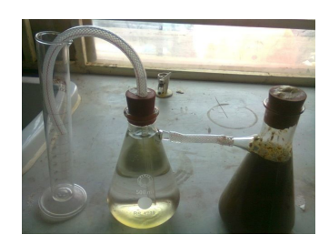
Figure 6: Risen slurry in the digester