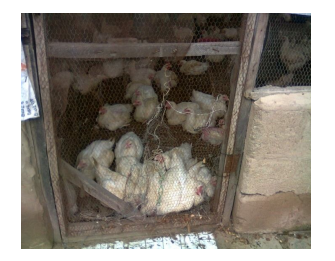
Figure 5: Poultry where waste was collected