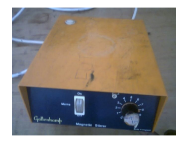
Figure 2 Magnetc stirrer Gallenkamp