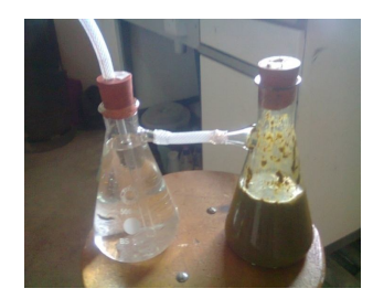
Figure 4: Unrisen slurry in the digester