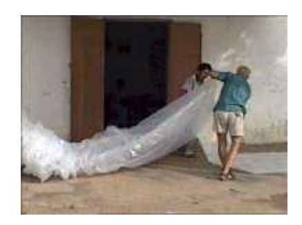
Photo 10. Putting one plastic inside the other to give added strength