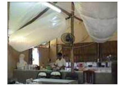
Photo 95. Reservoir bags storing biogas in the the laboratory of UTA