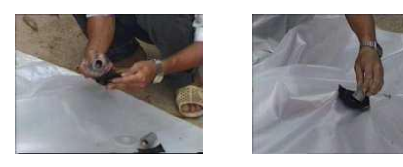
Photo 16. Preparing the materials for Photo 17. Tightening the gas outlet (without using the gas outlet glue)