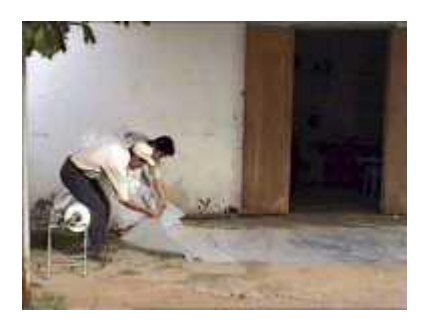
preparation for putting it inside the other