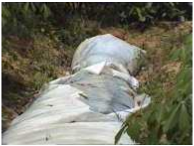
Photo 81. The outer plastic layer damaged (after 3 years..!). The inner one is still gas-tight.