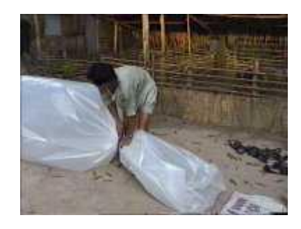
Photo 30. Tying the tube but leaving enough plastic to insert the outlet pipe