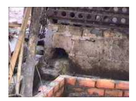
Photo 64. A channel is made with bricks to lead the waste from the pig pen to the inlet of the biodigester

Channels are made with bricks and cement to link the waste outlets from the pig pens with the inlet of the biodigester.