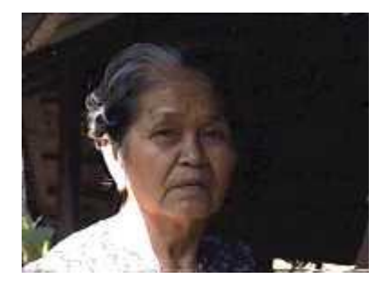
Photo 62. A string around the bag is used<br/>to increase the pressurePhoto 63. It is the women who benefit most from<br/>the installation of a biodigester