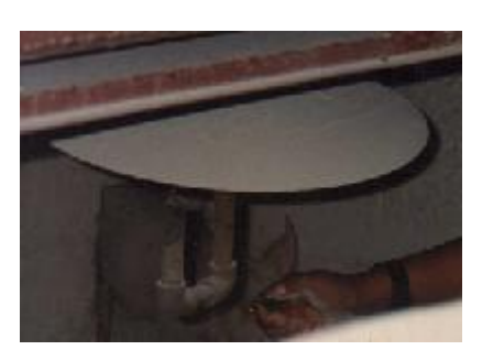
Photo 99. The use of biogas to heat the piglets in Pozo Verde farm, Jamundi, Colombia

Photo 98. A large reservoir bag provides biogas for a diesel generator in the integrated farm of Pozo Verde, Colombia