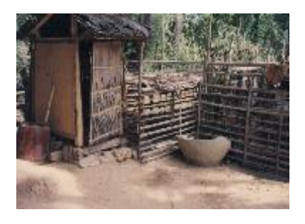
Photo 75 . In Cambodia the latrine is always linked to the plastic biodigester