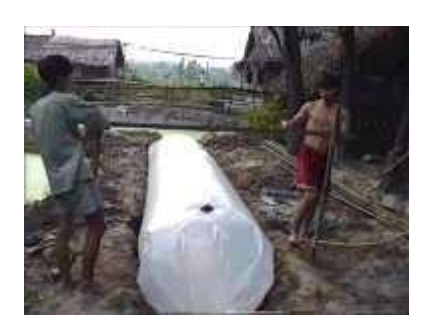
Photo 41. Connecting the PVC pipe to the Photo 42. A support is prepared to hold the gas gas outlet exit line