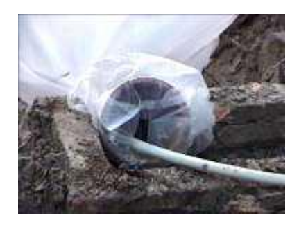
rigid PVC tube) to the PVC gas outlet Photo 44.Adding water when a pump is available