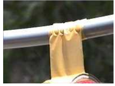
Photo 79 .Make a hole in the PVC pipe, take the water out and stick it again with tape or a rubber band (# 6-2)