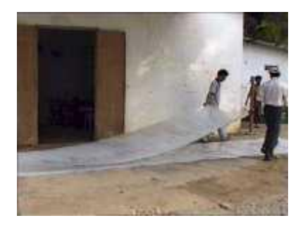
Photo 6. Putting a steel rod (or bamboo pole) through the centre of the roll facilitates the extraction of the required length of tube