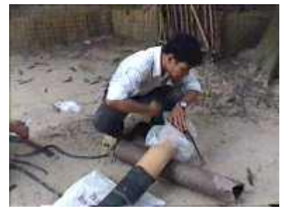
Photo 25 . Covering the entrance of the inlet pipe with a plastic bag

The polyethylene tube is filled with air before being located in the trench. From the open end, air is forced into the tube in waves formed by flapping the end of the tube in a forward propelling movement of the arms. The tube is then tied with a rubber band about 3m from the end so that the air does not escape. This is to facilitate fitting the exit ceramic tube which is put in place using the same procedure as for the inlet pipe.