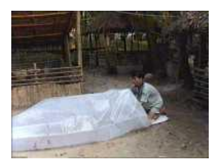
Photo 33. Tying the 3 m length of plastic Photo 34. Pumping air (look at the position of the tube to the exit pipe hands)