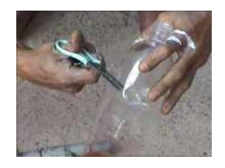
Photo 45. Materials to prepare the trap (PVC "T" and PVC pipe, old plastic bottle, knife and water)

Photo 46. Cutting a hole to add the water